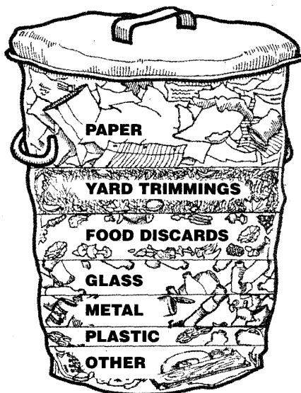
Often, over half of home wastes are compostable.

A balance of five essential ingredients is the key to rapid, trouble-free composting. If you maintain a pile with the correct balances of moisture, air, and carbon and nitrogen contents of the raw materials, then decomposing organisms—insects, worms, bacteria, and fungi—will do the rest.