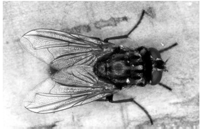
House fly adult

Homeowners and restaurants should remove garbage at least twice a week and keep the area clean.