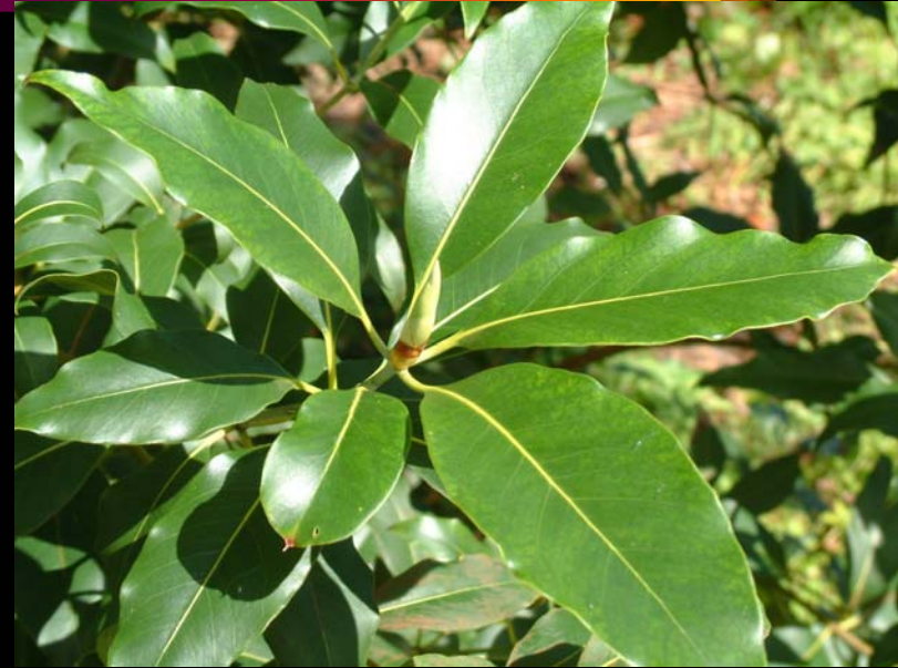
Brush box Lophostemon confertus